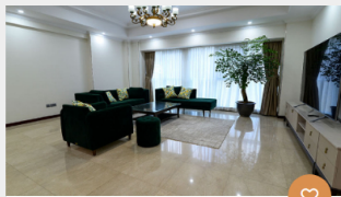
A Generous 280sqm Apartment at L2 Tower, Ciputra Hanoi for Rent with golf