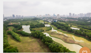
Stunning Golf course view 3-Bedroom Apartment for Rent Ciputra Hanoi