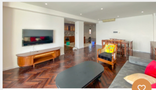
Lakeview with amazing view 03 bedroom apartment for rent in Tu Hoa Tay west lake