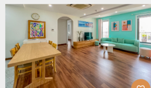
Westlake Cozy stylish 2 bedroom apartment in To Ngoc Van, New - big