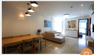
Modern furnished 3 bedroom Apartment at The Links L1 Ciputra Hanoi for rent