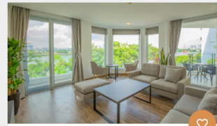
Natural light and good quality 03 bedroom apartment for rent in Tay Ho