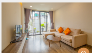
Well furnished 2 bedroom apartment in Xuan Dieu for rent