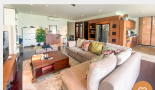
High-en remarkable 3 bedroom apartment in To Ngoc Van, Huge balcony - Comfy